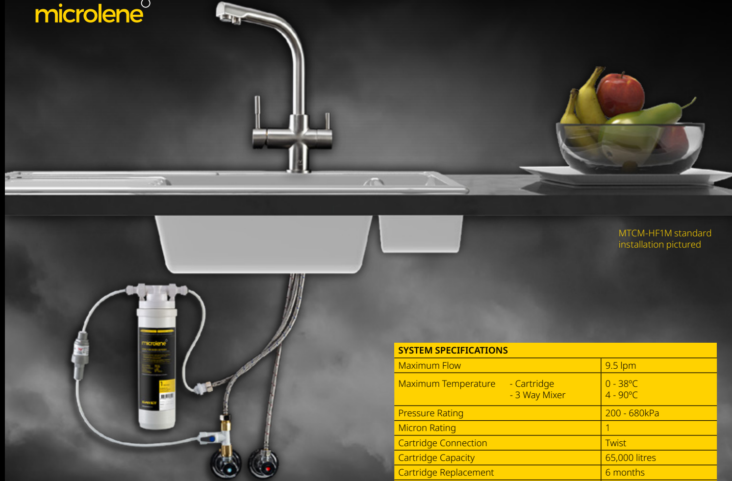
MTCM-HF1M standard installation pictured